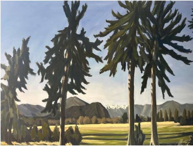
7. Mount Iron 762 x 1016mm