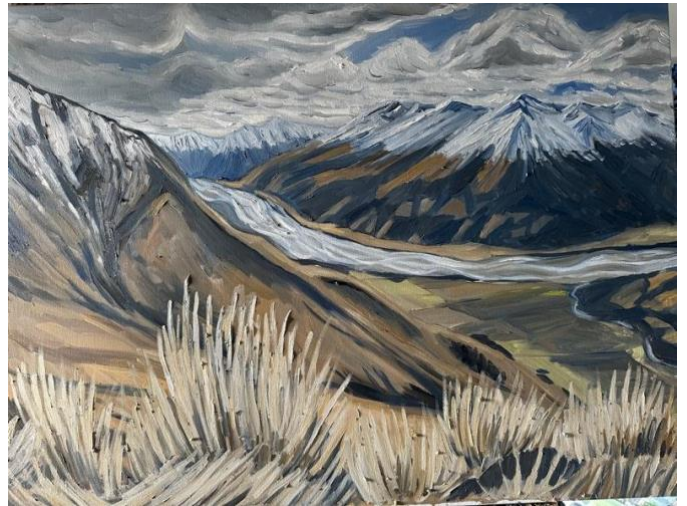
10. Matukituki River 762 x 1016mm