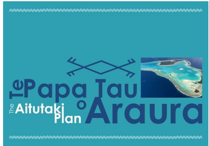
The Spatial Plan for Aitutaki adopted 2020

The Cook Islands is dedicated to championing sustainability, yet Aitutaki, one of its most pristine islands, faces a serious waste management issue. This fragile paradise currently depends on a large, makeshift landfill to handle its waste. Recognising the urgency of this problem, the internationally award-winning 2020 Spatial Plan, created by NZ based urban design firm Reset, highlights waste management as a top priority ( https://reseturban.co.nz/projects/aitutaki-plan-cook-islands/ ).