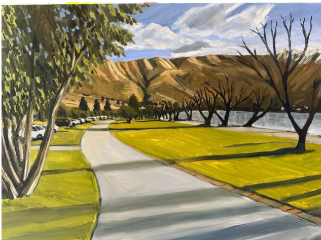
11. Wānaka Lakefront 762 x 1016mm