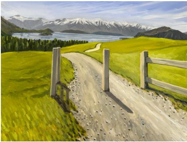
1. Shared Path 500 x 700mm