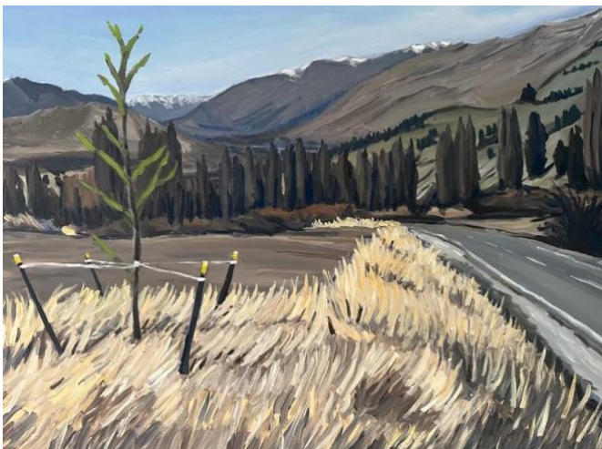
5. Cardrona Valley 762 x 1016mm