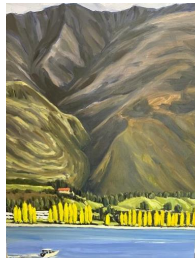
4. Rippon Valley 500 x 700mm