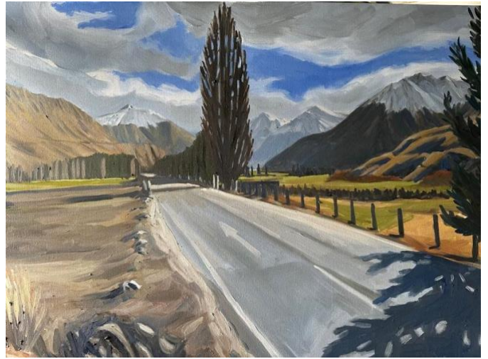
8. Road to Mount Aspiring 762 x 1016mm