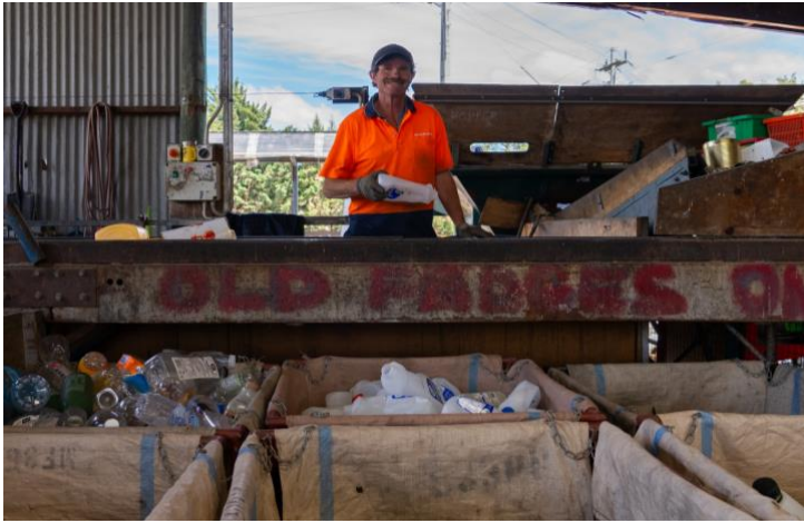
Real recycling by hand at Wastebusters