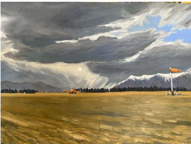
3. Taking off 500 x 700mm